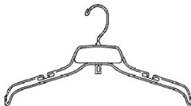
TOP HANGER K resin Color clear Wire hook 10, 12, 15, 17 and 19 inch

15", 17", or 19" Top Hanger 12" or 14" Bottom Hanger